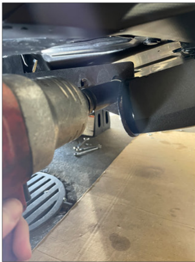
9. Secure with an air gun.