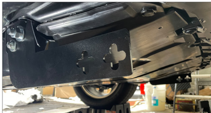
5. Complete bracket installation.