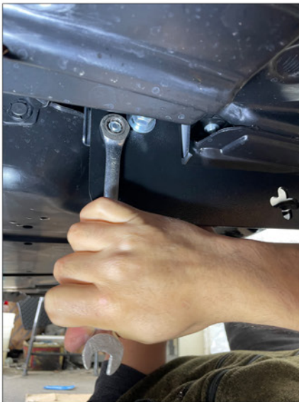
4. Fix the screws with tools