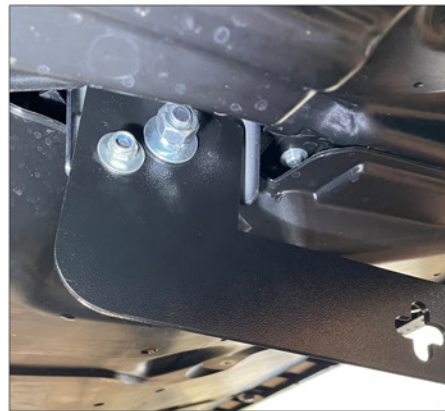
3. Mounting brackets