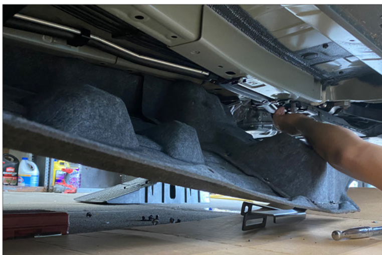
2.Remove part of the fender of the front car.