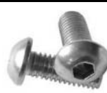
T : M6X15 Bolt (2PCS)