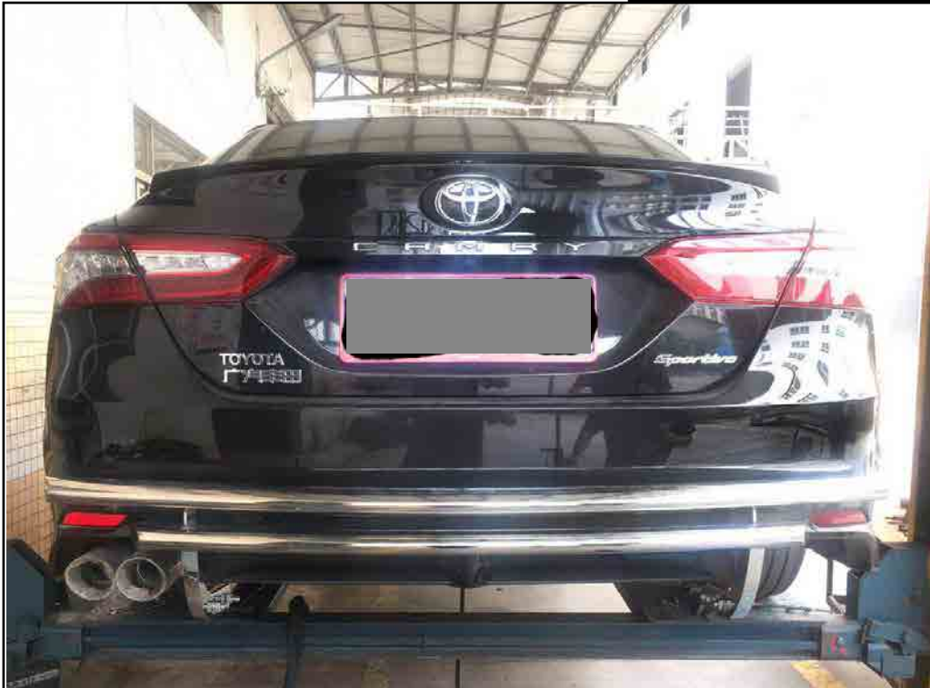
Insallation is finish