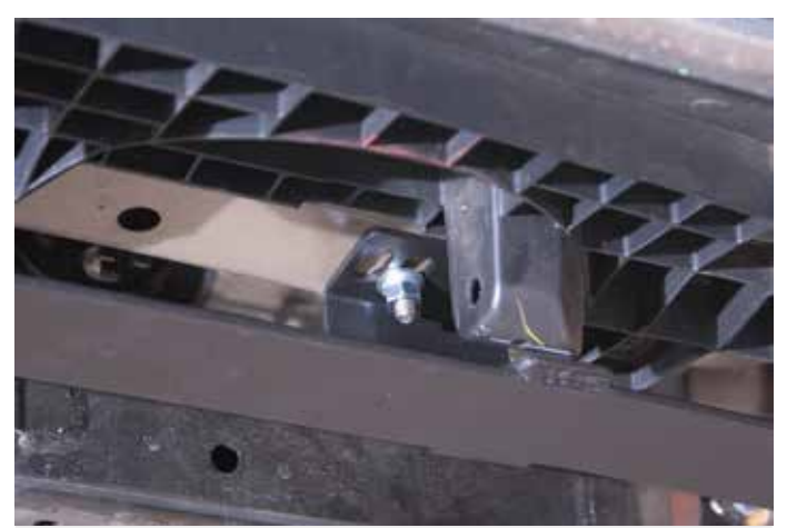
Attach the brace with (1) 5/16" Flat Washer and (1) Lock Washer per side.