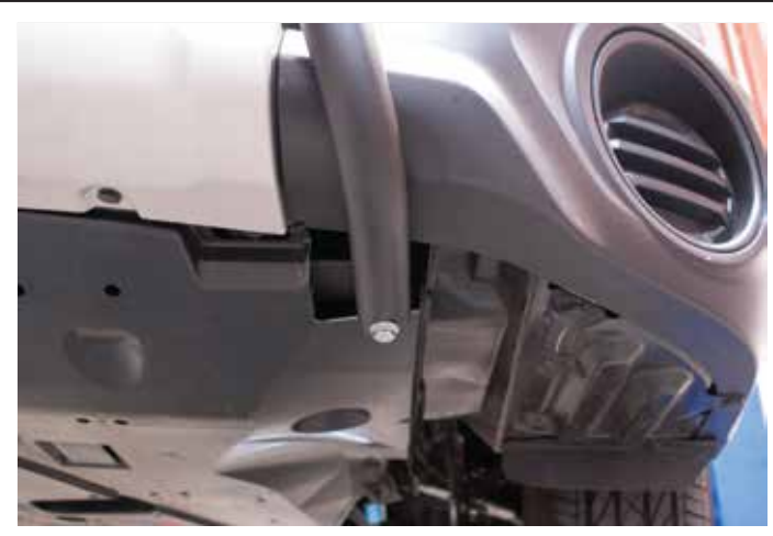
Cut the splash guard by following the outer crease until the bar clears.