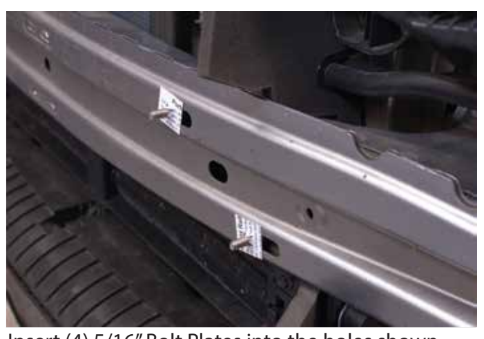
Insert (4) 5/16" Bolt Plates into the holes shown. Slide the Bolt Plates towards the center of the vehicle.