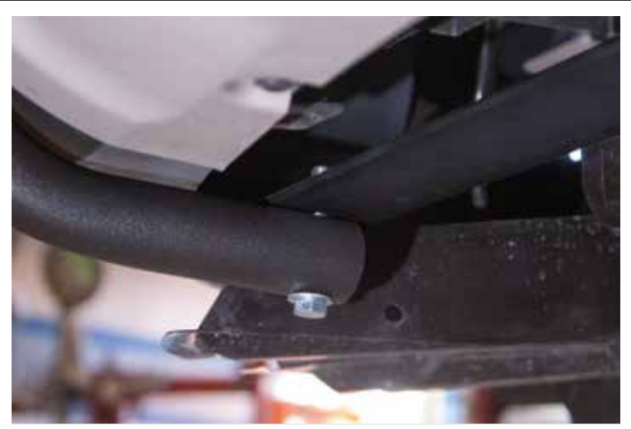
Attach the Light Bar to the Lower Brace with (1) 3/8" x 2.5" Hex Bolt, (2) Flat Washers, (1) Lock Washer, and (1) Hex Nut.