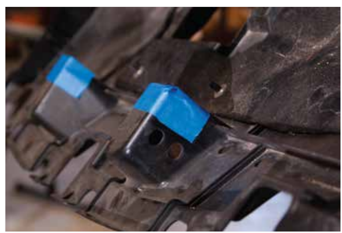
Cut the splash guard as shown by the tape.