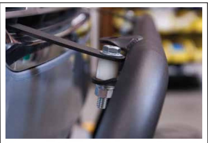
Attach the Light Bar as shown with (1) 3/8" x 1.75" Hex Bolt, (1) Flat Washer, (1) 3/4" Nylon Spacer, (1) Flat Washer, (1) Lock Washer, and (1) Hex Nut per side.