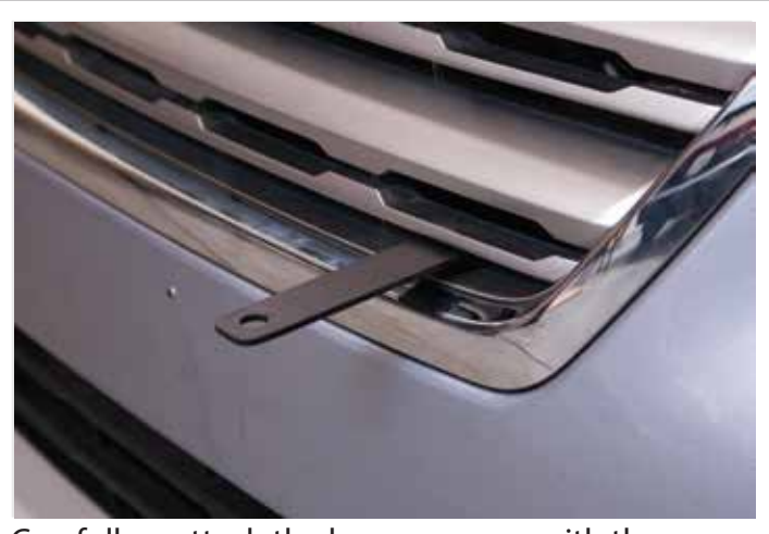
Carefully reattach the bumper cover with the Upper Brackets through the grill as shown.