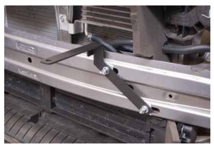
Attach (2) Upper Brackets to the bumper beam. Fasten with (1) 5/16' Flat Washer, Lock Washer, and Hex Nut on each Bolt Plate.

Remove the front bumper cover and the foam piece in front of the bumper beam.