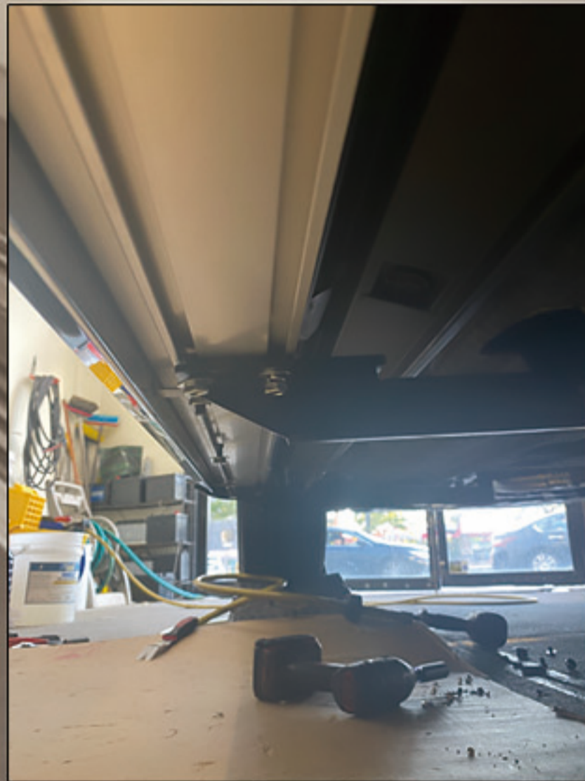
12. Pedal fixed installation completed