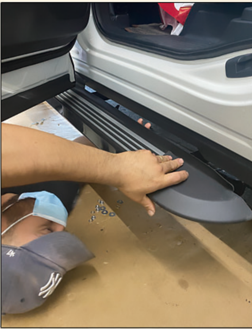
11. Reconfirm the installation height of the pedal.