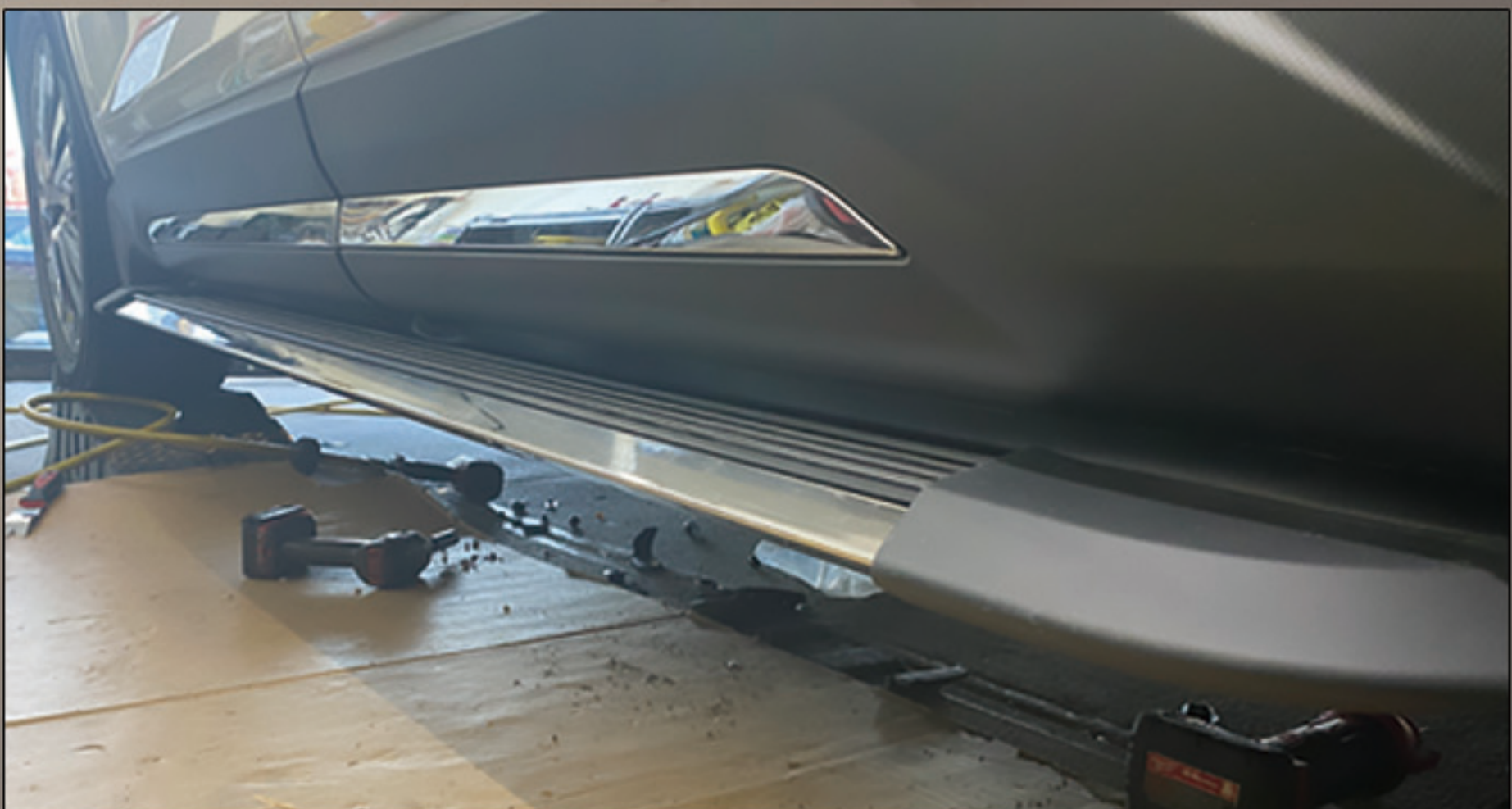
13. Complete the pedal installation.