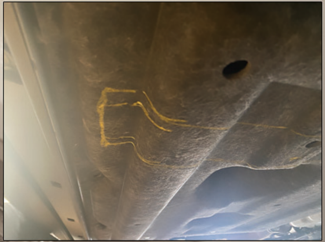
2. Draw the installation position of the bracket on the fender.