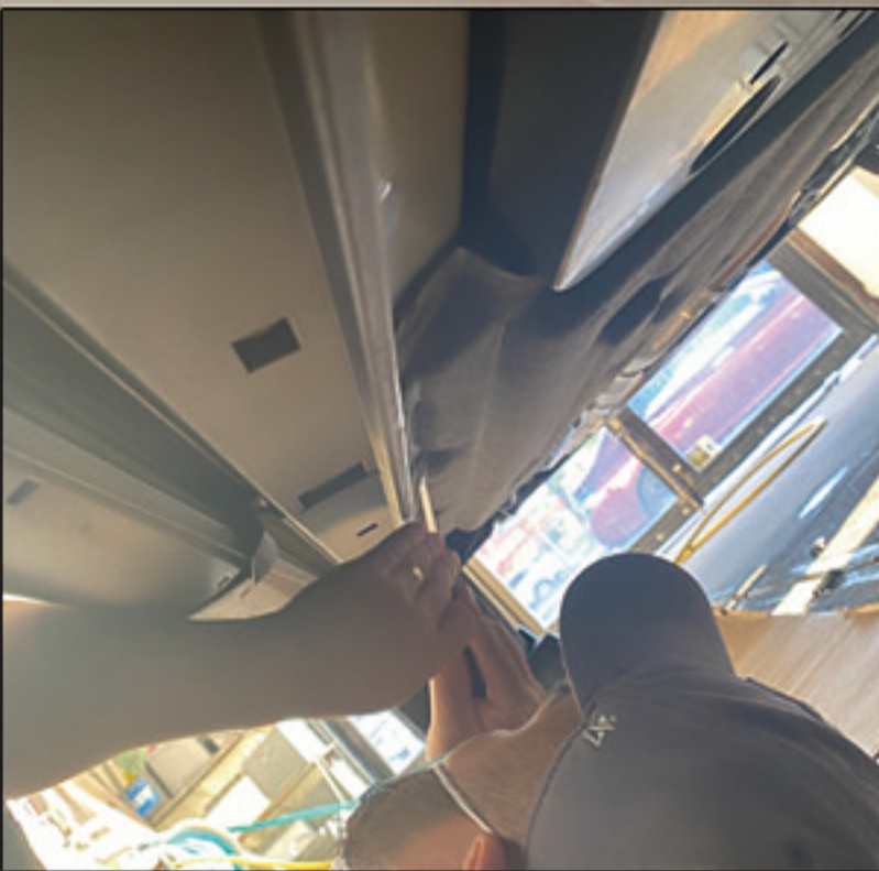
3. Remove the screws on a part of the mudguard.