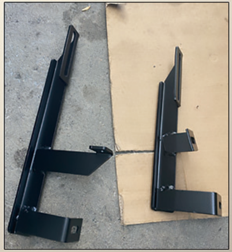
1. Prepare tools and fender brackets.