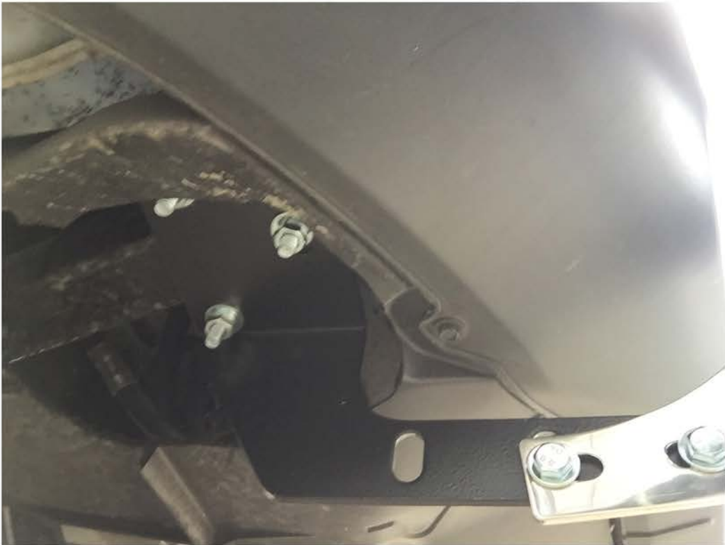
Driver's Side View