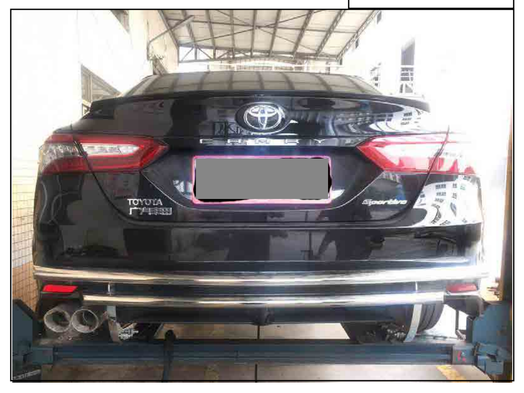
Page 2 of 2