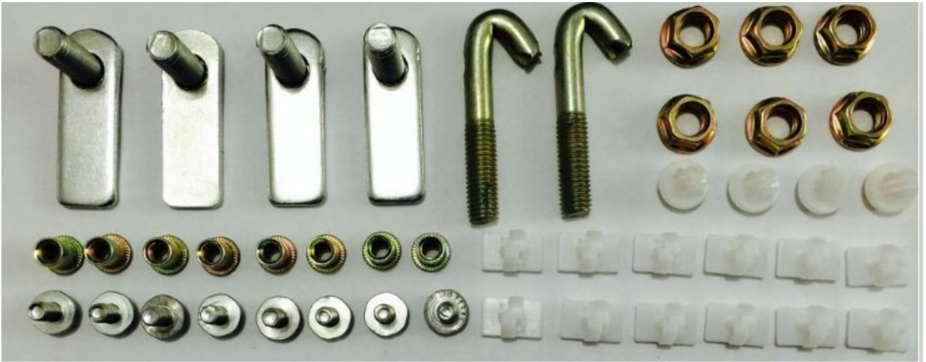
Figure 1: Parts List

Figure 2: Take the left side as an example. Remove the original side beam and expose six holes on the side. Insert the expansion nut at the 2-5 hole position, the 2.3 nut is placed at the front end of the hole, and the 4.5 nut is placed at the rear end of the hole. Remove the black plug and hang the steel hook. T-hooks are hung on the bottom of the middle of the 2.3 hole position and the middle of the 4.5 hole position.