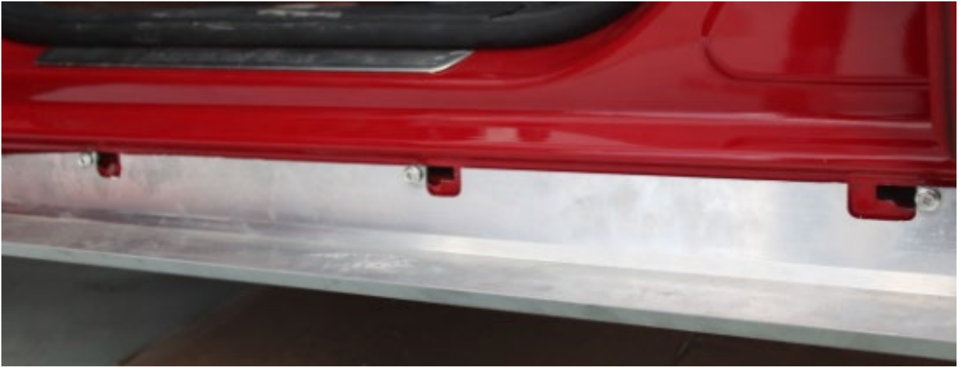
Figure 4: Attach the pedal to the plastic part of the pedal, install the pedal, and cover the plastic cover. The installation is complete.