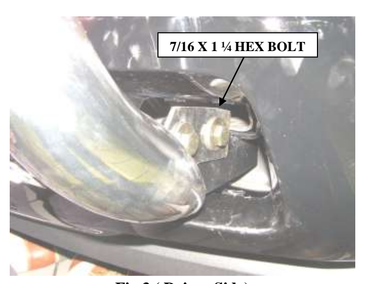
Fig 3 ( Driver Side)