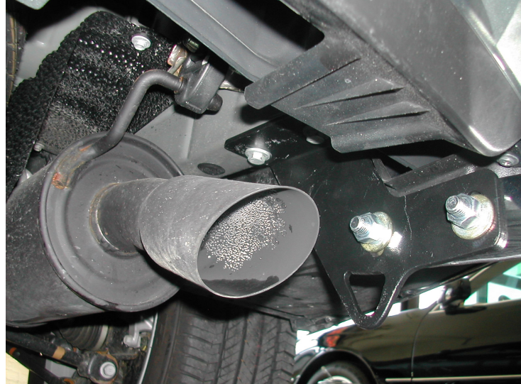
Fig. 3 Fig. 4