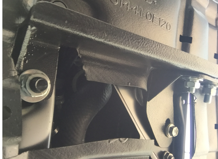
Fig. 5 Fig. 6