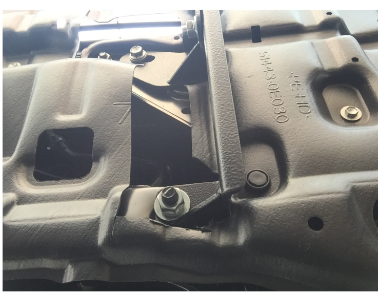
Fig. 1 Fig. 2