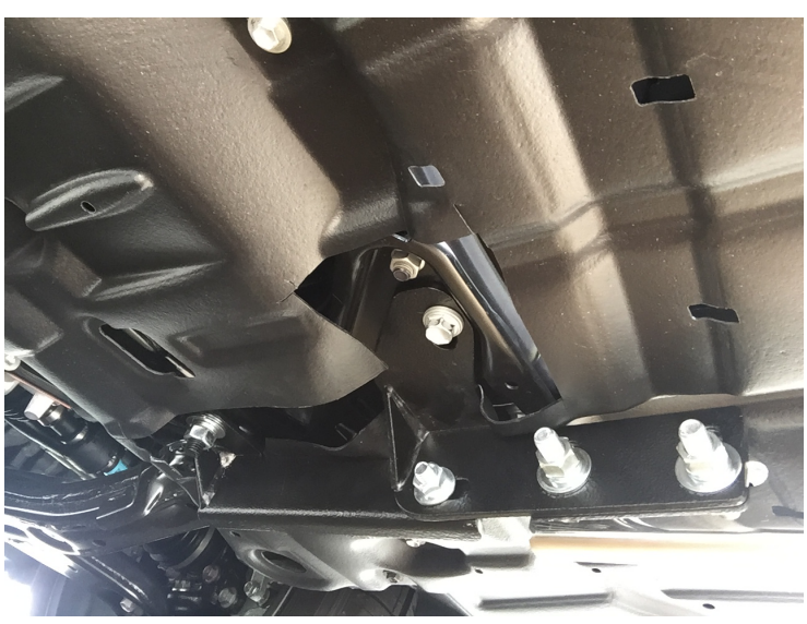
Fig. 3 Fig. 4