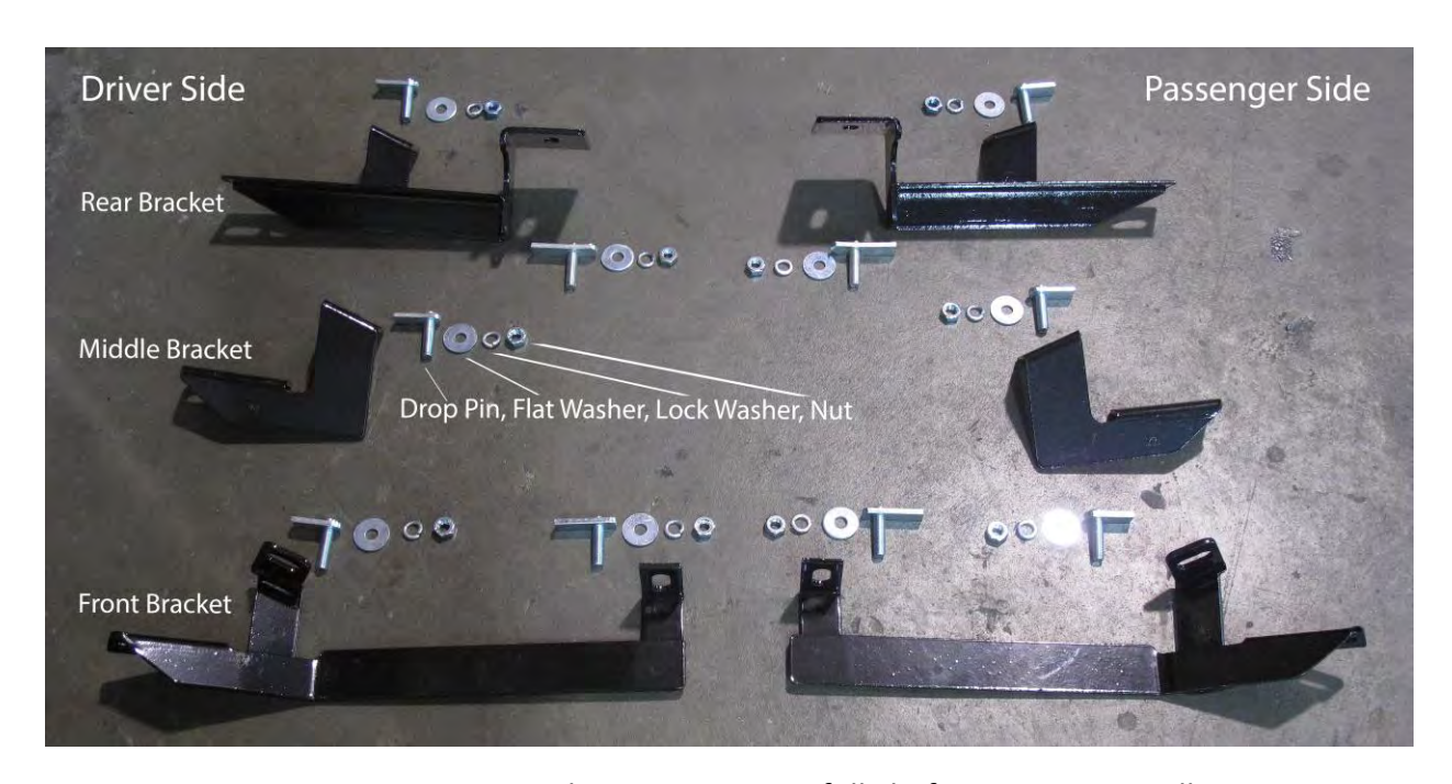
STEP1: Verify all parts are present. Read instructions carefully before starting installation.