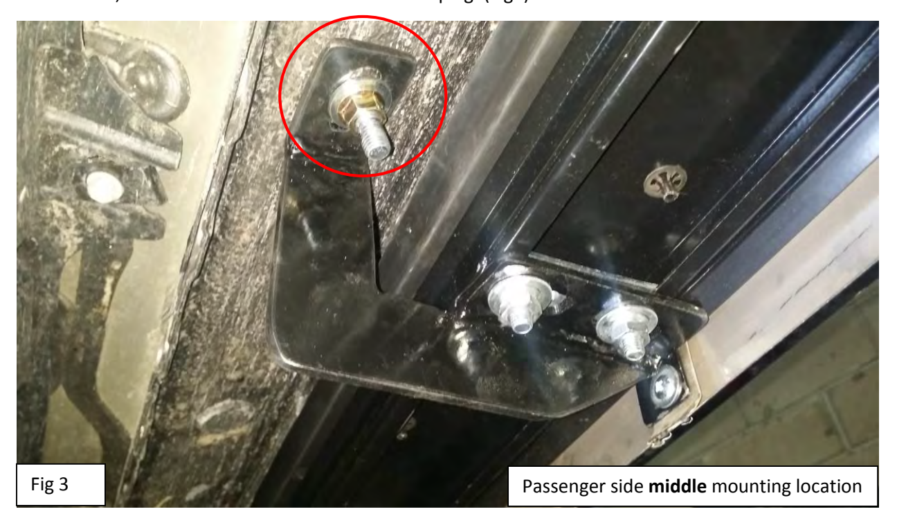
STEP4: Insert a drop pin into the factory hole. Select passenger side middle mounting bracket and secure it with a flat washer, a lock washer and a nut. Do not tighten hardware at this time. (Fig3)