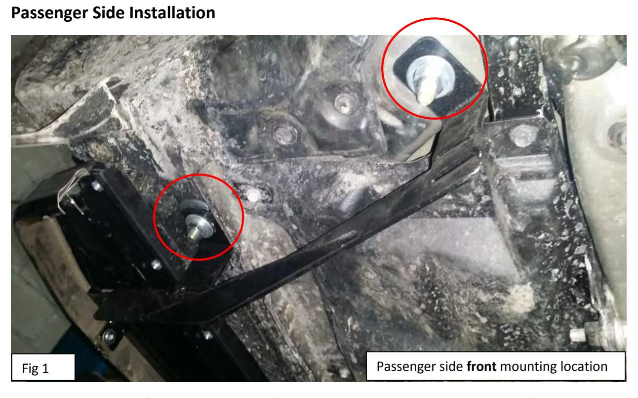
STEP2: Starting on the front passenger side of the vehicle, insert two drop pins into the factory holes. Select passenger side front mounting bracket and secure it with flat washers, lock washers and nuts. Do not tighten hardware at this time. (Fig1)