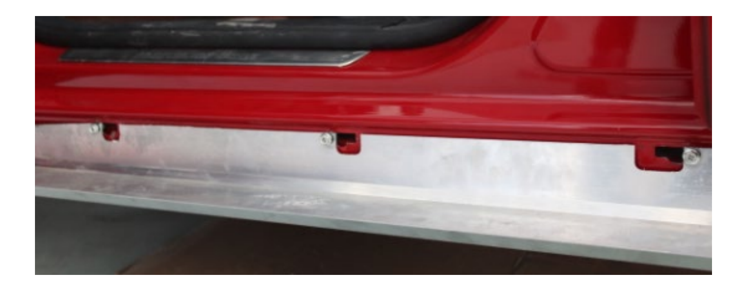
Figure 4: Attach the pedal to the plastic part of the pedal, install the pedal, and cover the plastic cover. The installation is complete.