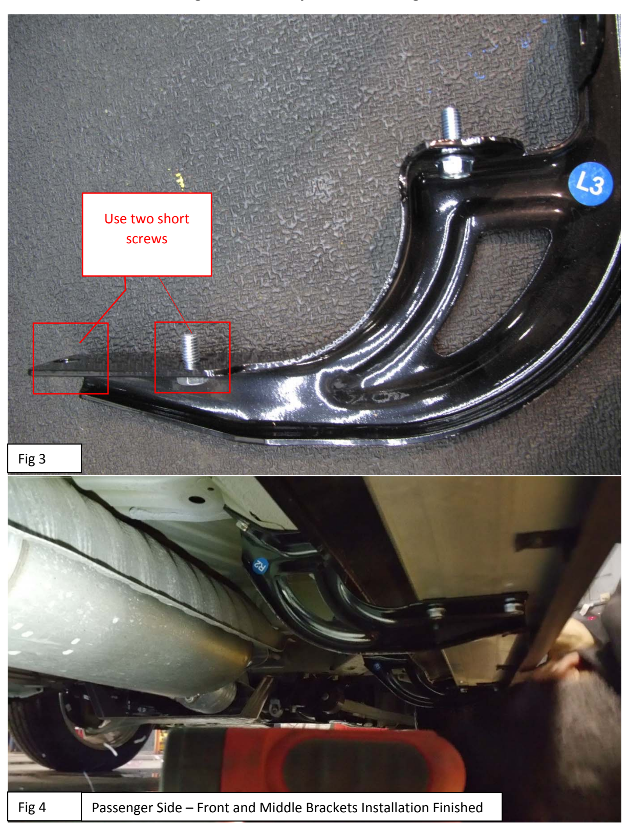
STEP3: Mount the Passenger side running broad on the brackets using two Short Screws on each bracket as shown on Fig3. Level and adjust the board, tighten the hardware in the end.