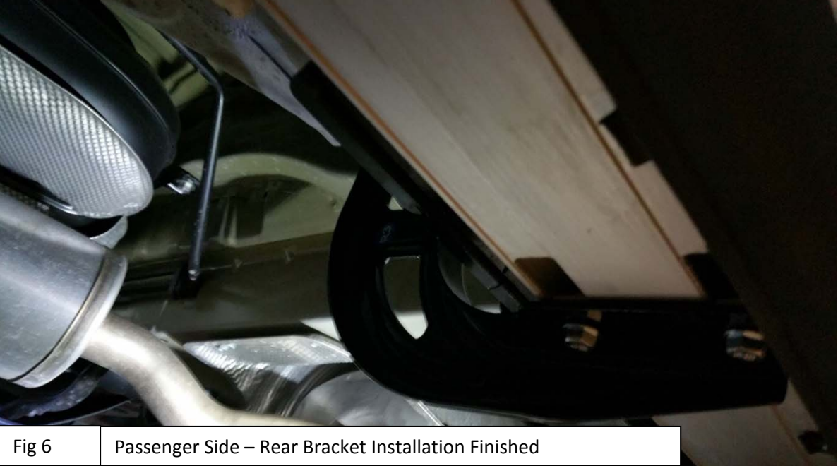
STEP4: Repeat step2-3 for the Driver Side Installation.