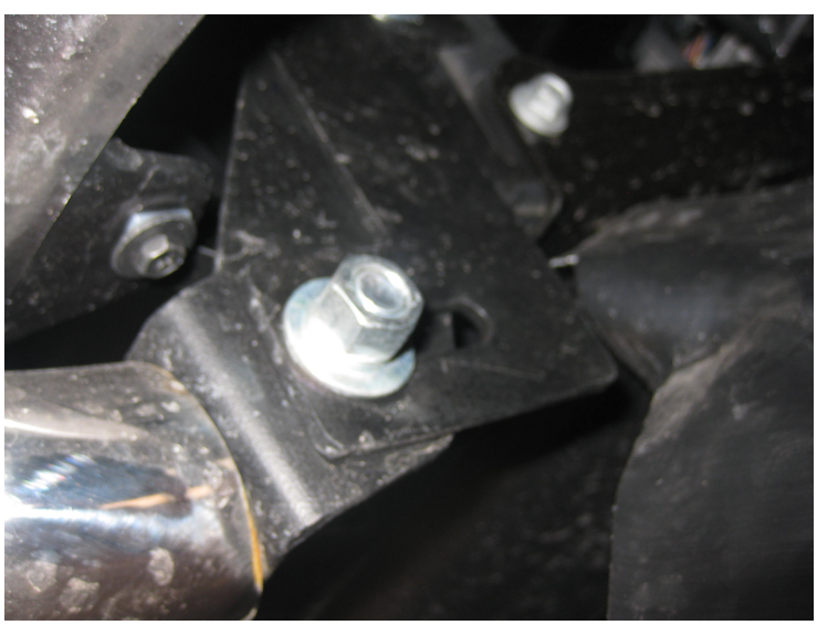
Fig. 3 Fig. 4