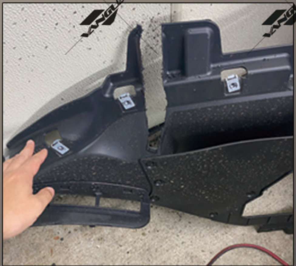
3. Cut off part of the fender space to leave a place for the bracket to install.