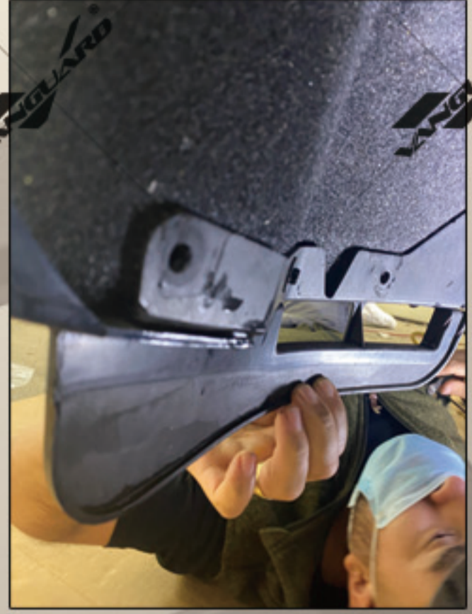
1. Remove the mudguard under the car first.