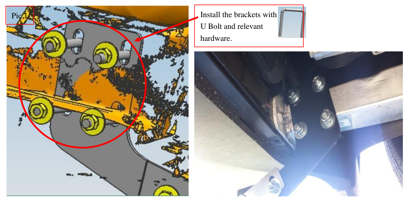
Step 3: Install the side bar on the brackets and tighten up hardware after adjusting the brackets.

Step 2: Distinguish the left and right according to the print R and L. It is easier for your installation by putting the bracket with its fastening pieces together.